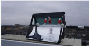
Scientists take inspiration from plants to power cars

Check out the BBC Newsround website to follow what is happening in the world of Science