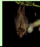
How can spit be used to study bats?