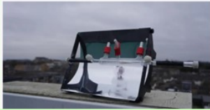
Scientists take inspiration from plants to power cars

Check out the BBC Newsround website to follow what is happening in the world of Science