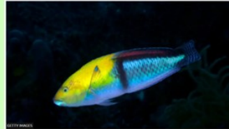
Clever fish 'use tools to open shells'