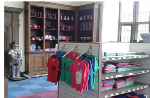
Tuck shop/gift shop