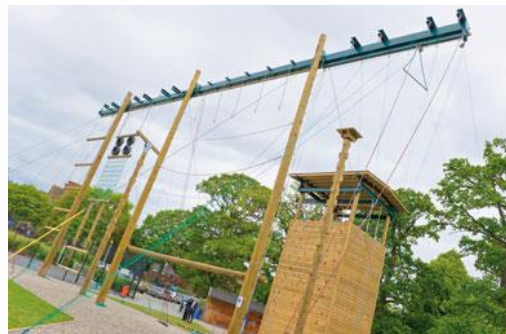
High rope course