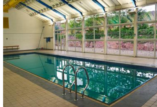
Indoor swimming pool