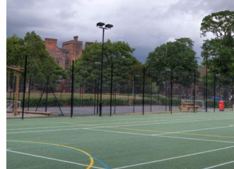
All weather sports pitches