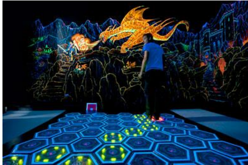
Grid of Stones