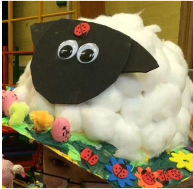
Junior Eggstravaganza - Thursday 26th March